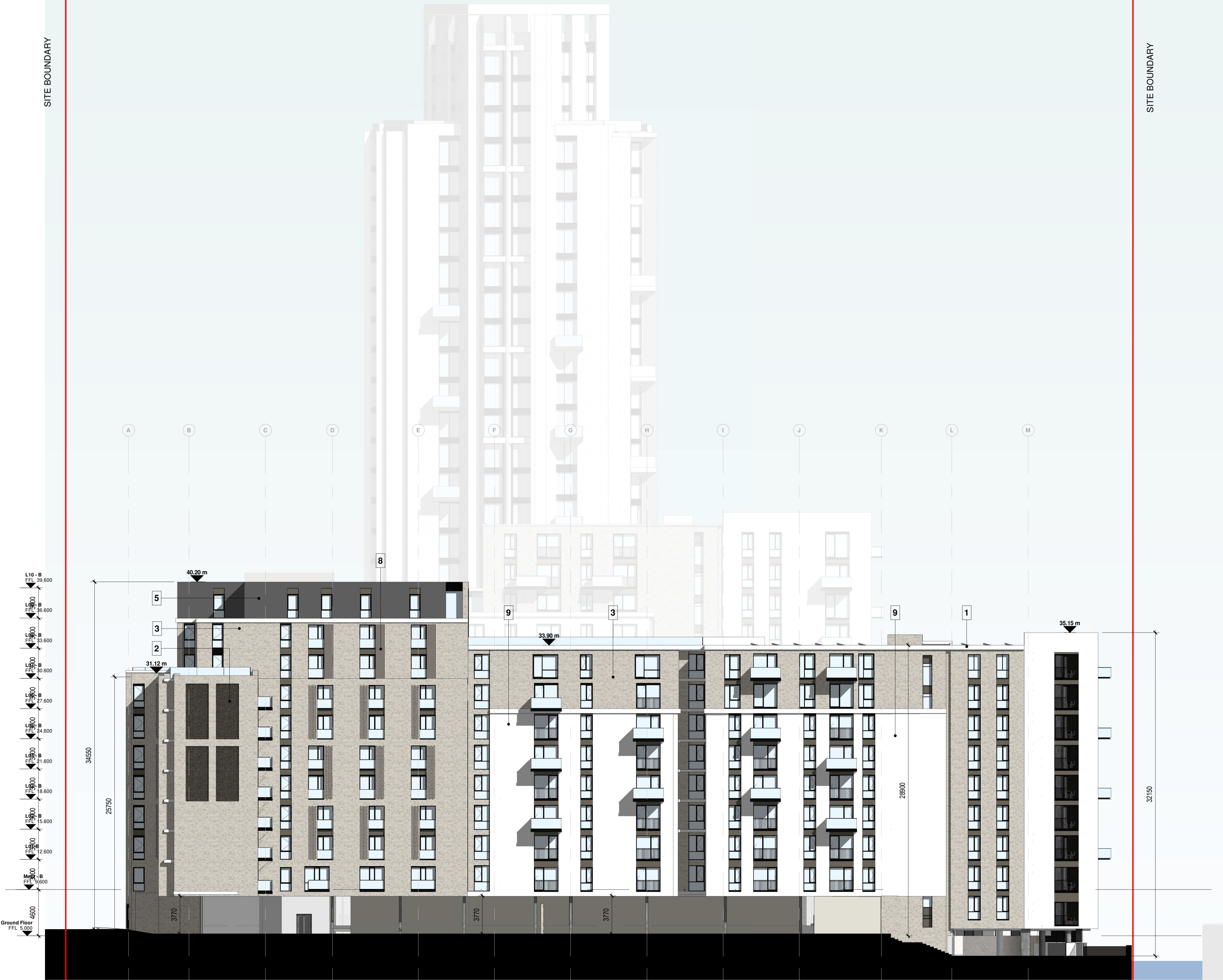
West Elevation 1 : 200

Notes: DO NOT SCALE FROM THIS DRAWING. USE FIGURED DIMENSIONS IN ALL CASES. VERIFY DIMENSIONS ON SITE AND REPORT ANY DISCREPANCIES TO THE ARCHITECTS IMMEDIATELY. THIS DRAWING TO BE READ IN CONJUNCTION WITH THE ARCHITECTS SPECIFICATION. © THIS DRAWING IS COPYRIGHT AND MAY ONLY BE REPRODUCED WITH THE ARCHITECTS PERMISSION.